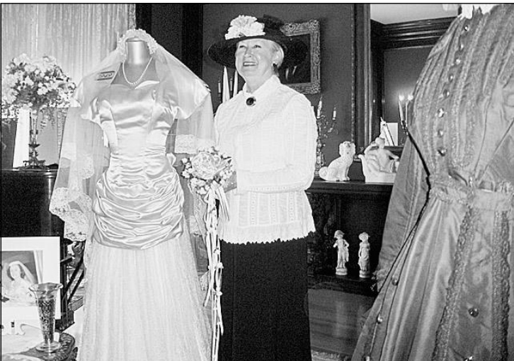
MEYERS HOUSE GUILD